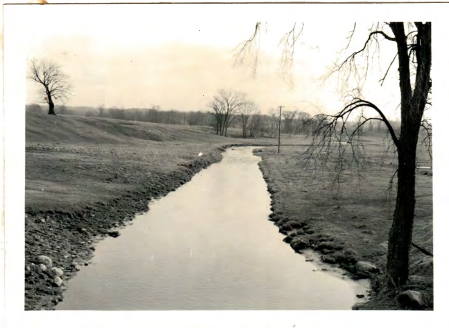
Bear Creek, Kent County, showing complete lack of bank cover brought about by heavy pasturing.