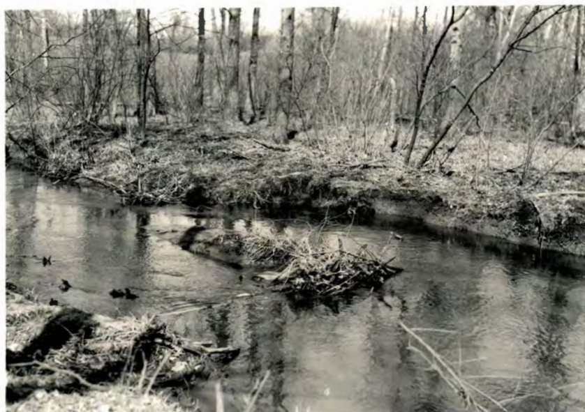
Honey Creek near upper end of frontage held by Kent County Conservation League. Notice sand and muck bottom, slightly undercut banks, and heavy stream-side shade. This photo shows the site of proposed devices 1 and 2, a deflector to confine stream to right channel, a raft to protect the right bank.