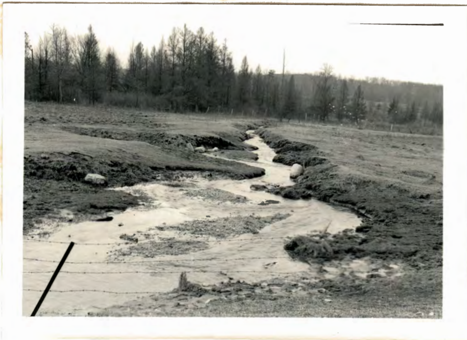
Tributary of Bear Creek, Kent County, showing general character of spring feeders in this vicinity.