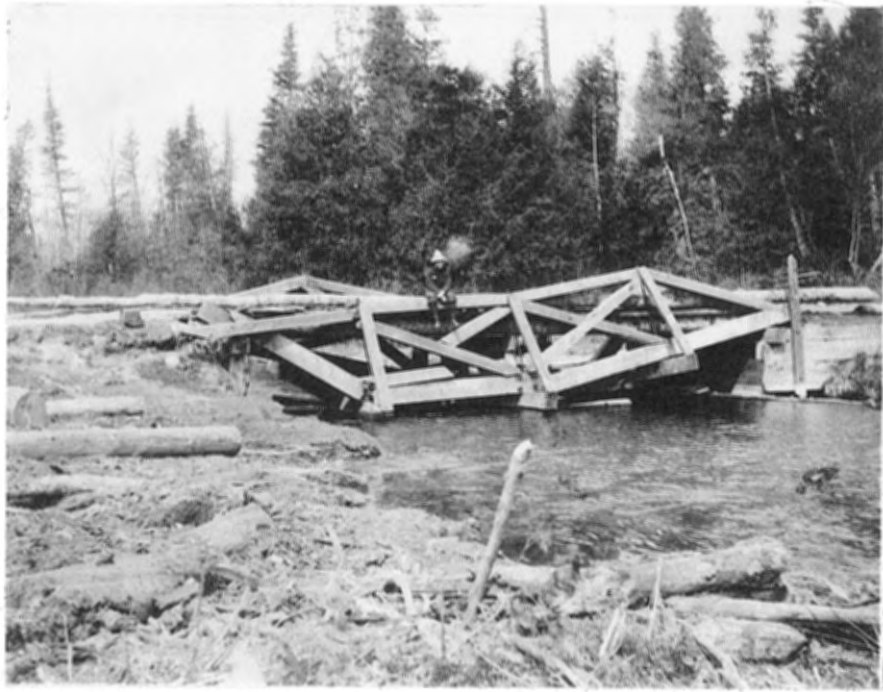
Figure 2. --Platte River at Hays (Haze) Bridge. Photograph taken probably in 1904.