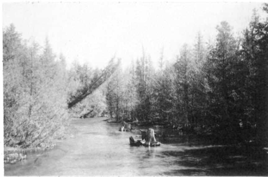
Figure 3. --Upstream view of Platte River from Hays Bridge, April 20, 1972. The pine stumps in the stream were placed there in 1958 for fish cover.