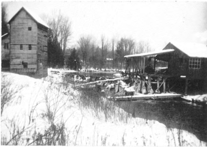
Figure 4. --The Clark Mills, about 1935.