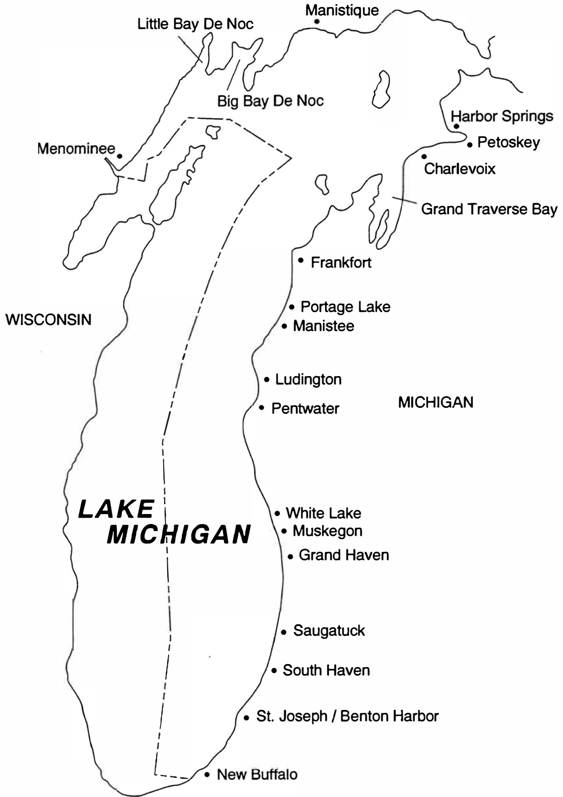
Figure 1.—Lake Michigan survey area.