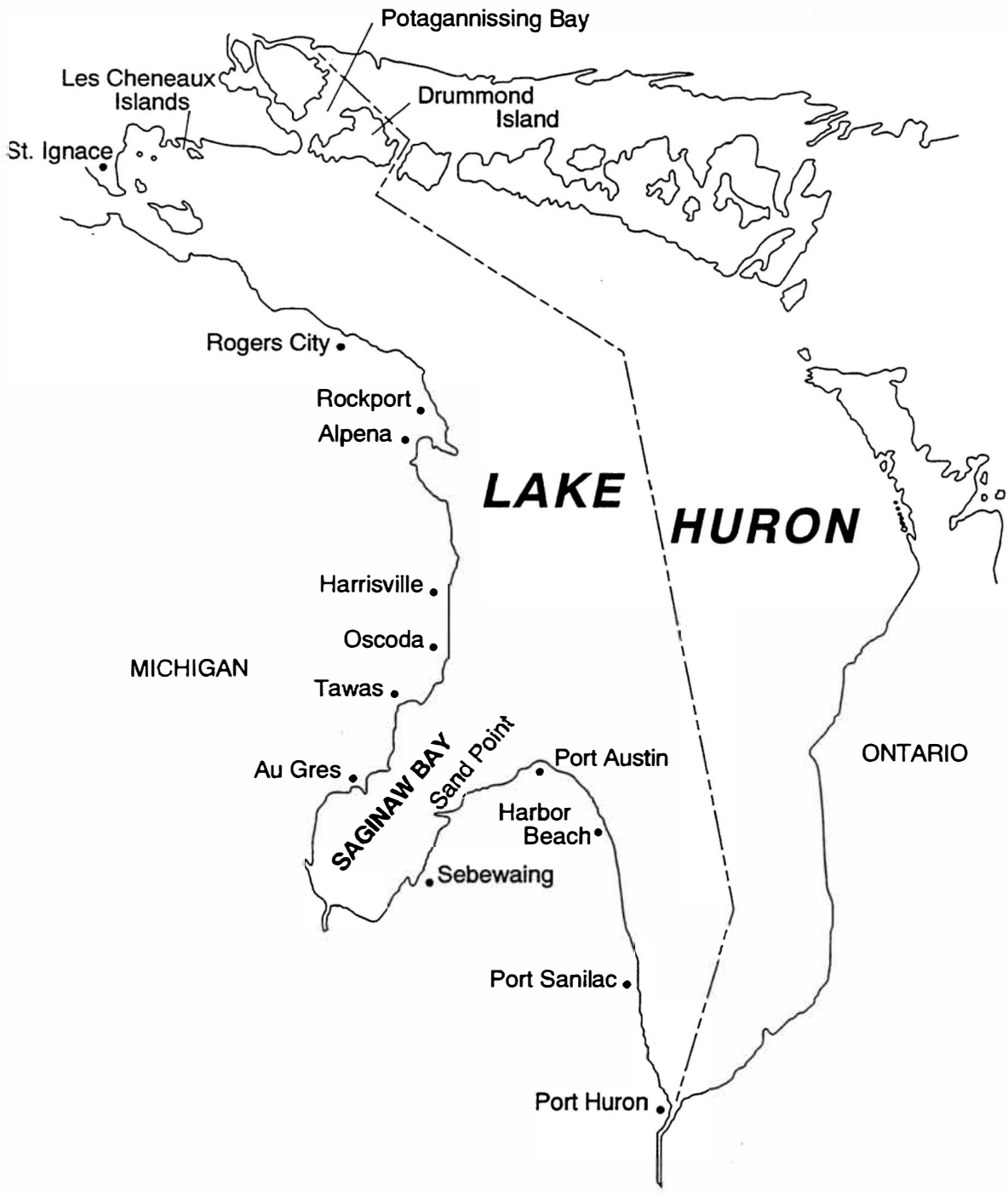
Figure 2.—Lake Huron survey area.