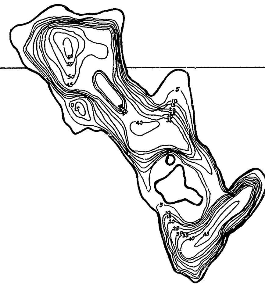
Contour Map Contour Interval = 5'

Area 76 Acres Length of Shore Line 2.0 Miles