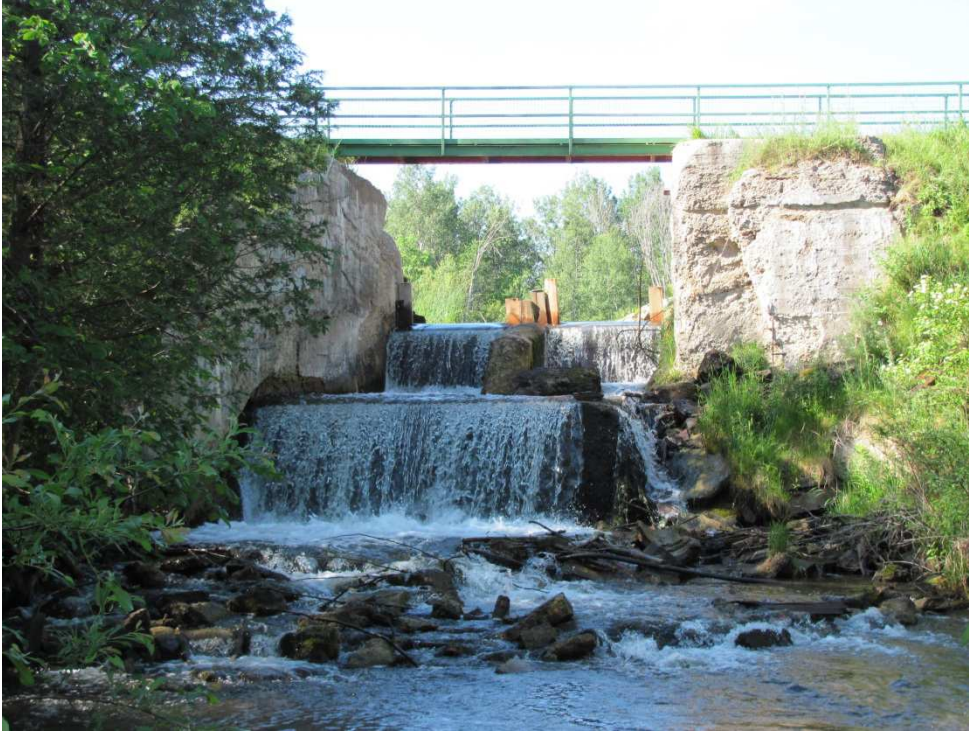
Photo 2. Manton Creek after the removal of Manton Millpond Dam.