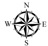
Locator Map 1:200,000

Remove the row of red painted trees along the south boundary of PU4