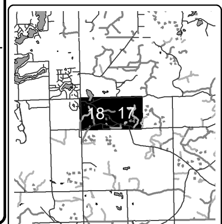
Locator Map 1:200,000