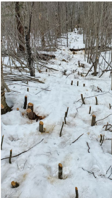
Clearing – brush & trees