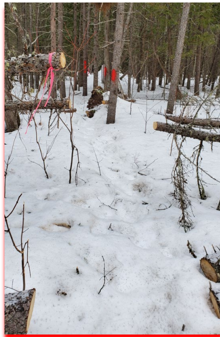
Clearing – downed trees