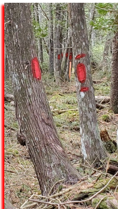
Face & Quarter Blazes Marked