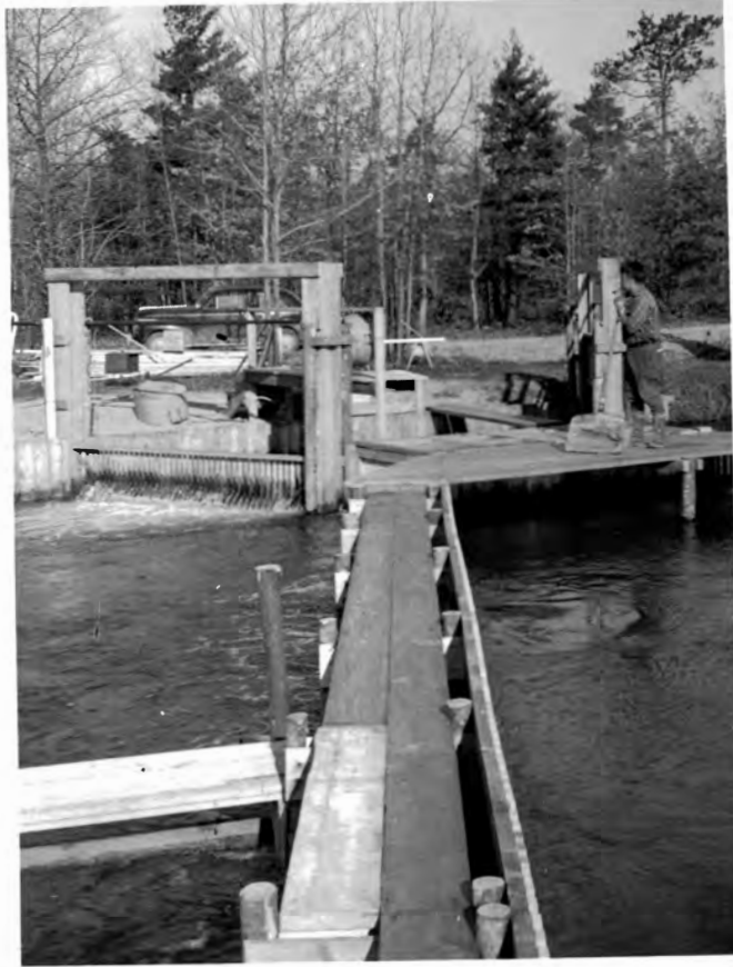
Fig. 2. Side view of weir showing boat gates.