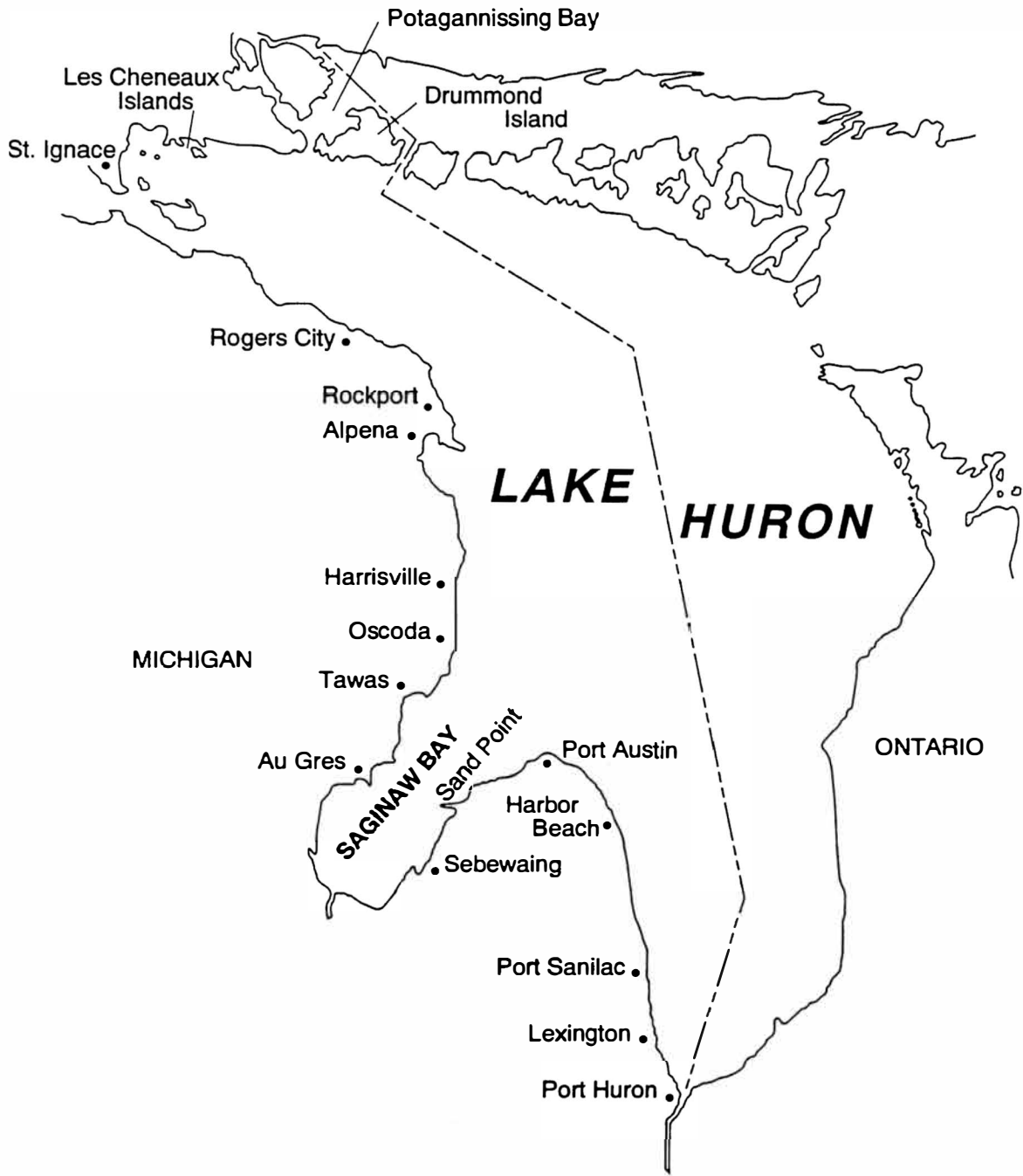
Figure 2.—Lake Huron survey area.