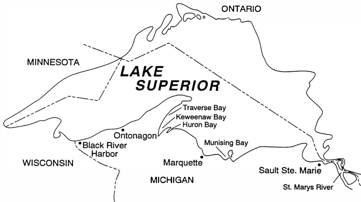
Figure 4.—Lake Superior survey area.