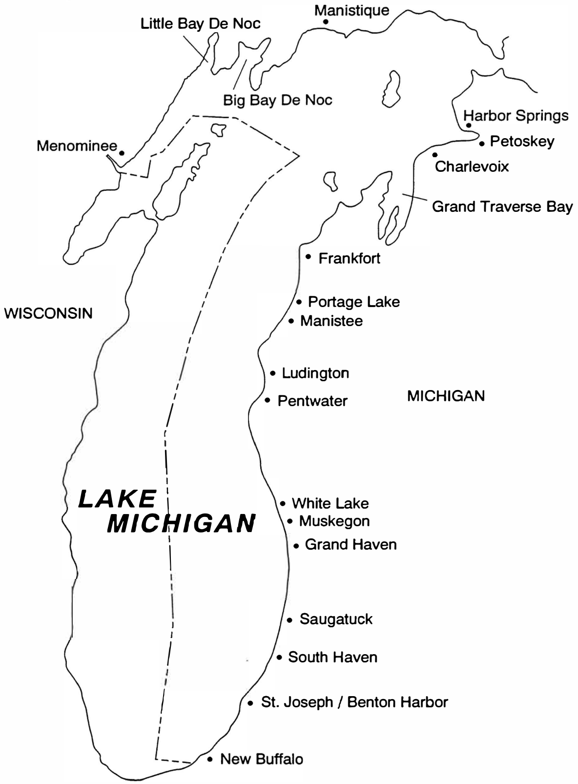
Figure 1.—Lake Michigan survey area.